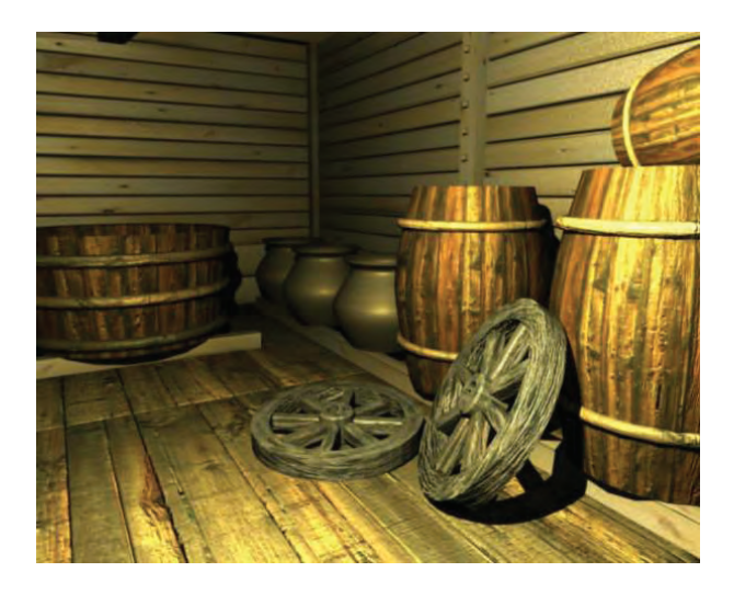
Figure 1: The reconstruction (by Gianni Rizzi) of the room interior shows the barrels, wheels and large containers along the wall, with the vat in the background. To be noted is the complete absence of nails and metal elements in the barrels and the vat, with wooden hoops instead being used to bind the staves together. The room was completely lined with planks and beams.

such that it was possible to conduct dendrochronological analysis, determine the ligneous species, and construct a 117-year chronology. Dendrochronology is the study of the annual growth of trees or timber sensitive to climate changes, and it enables the dating of wooden objects or their carbonized remains. Used as the reference curve for the Rosslauf material was the curve plotted for southern Bavaria by B. Becker,<sup>3</sup> which spans from AD 1985 to 546 BC. The arboreal species for the Becker curve is oak. Recent studies (Pindur 2001: 62-75) have successfully compared trees of different species which have grown in similar climatic conditions and in locations at a more than 250-kilometre distance from each other. Comparisons between the Rosslauf curve and Becker's curve yielded particularly significant and noteworthy data.